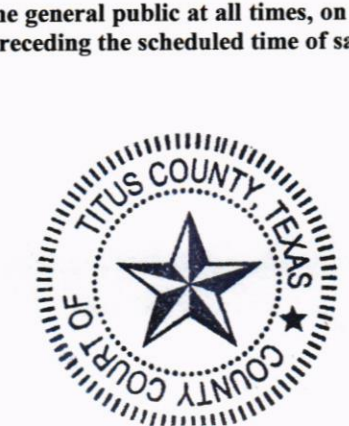
County Clerk / Deputy County